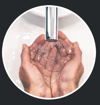
Ensuring Water Quality