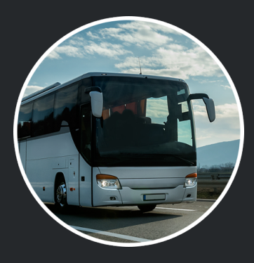
Enhancing customer services