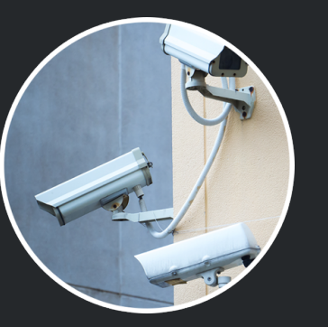
Securing business premises