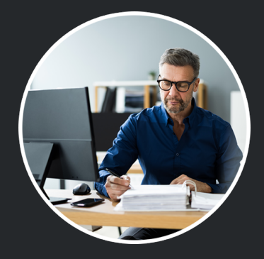
Desk Space Monitoring