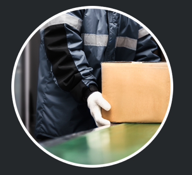
Transforming cold chain management