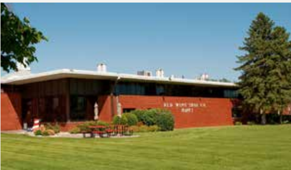
Plant 2 Facility in Red Wing, MN.

Red Wing operates two domestic manufacturing facilities in Red Wing, Minnesota and Potosi, Missouri. The Red Wing Store chain consists of over 440 stores in the United States and Canada through a mix of company and independently owned stores. The company also owns the S.B. Foot Tanning Company, which supplies premium leather for shoes, apparel, furniture and other applications.