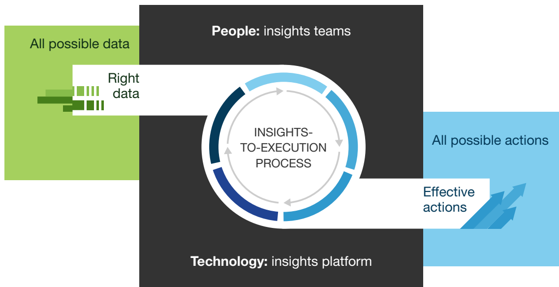
FIGURE 3 Systems Of Insight Close The Loop Between Data And Effective Action