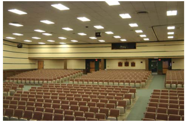
After new lighting system