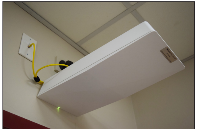
Easy wall or ceiling mounted RFID gateway for hands-free asset tracking.