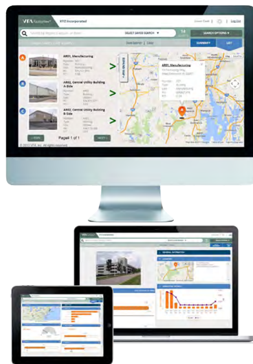
Access VFA FacilityView on a desktop, laptop or iPad®.