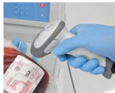
Accurate data and paperless process documentation with electronic bar code scanner