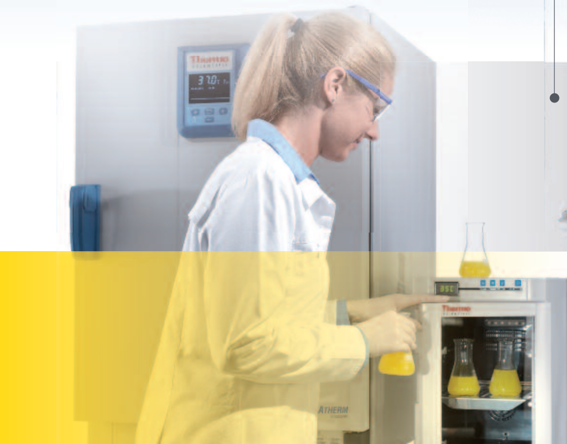
The perfect solution for personalized incubation