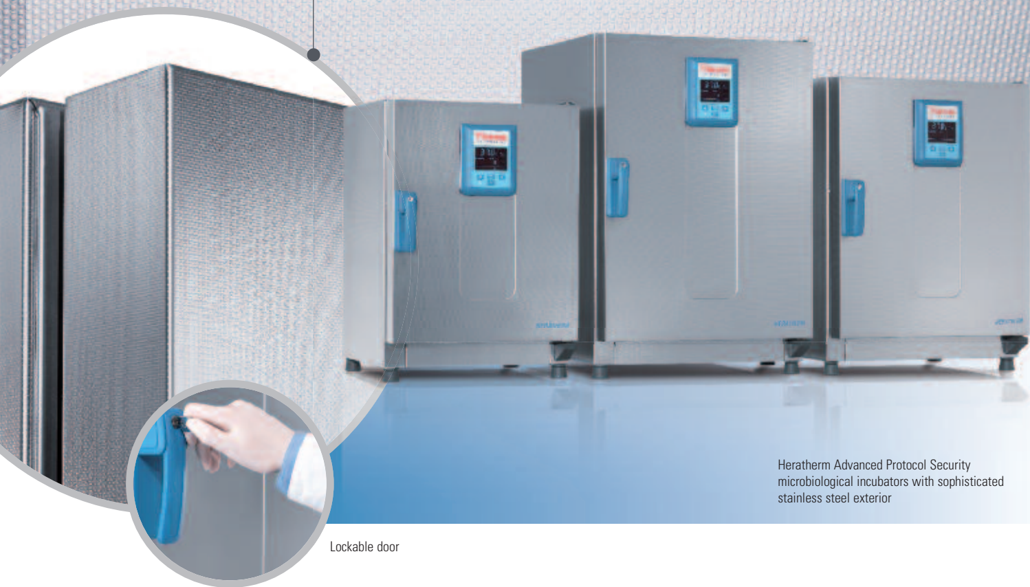
Heratherm Advanced Protocol Security microbial incubators with sophisticated stainless steel exterior