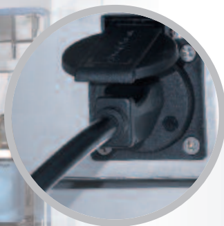
Heratherm Advanced Protocol microbiological incubator with internal socket and shaker inside the unit