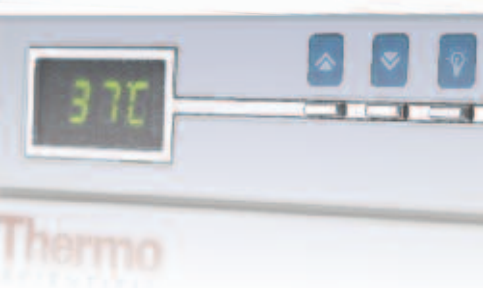
Easy to use interface