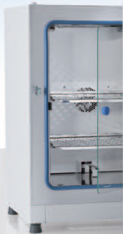
Thermo Scientific Heratherm Advanced Protocol Security microbiological incubator with unique dual convection