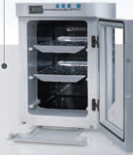
Heratherm Compact microbiological incubator, 18L

The most compact unit of the Heratherm microbiological incubators family has an 18L capacity, ideal for personalized workspace.