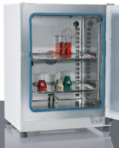
Heratherm Advanced Protocol Security microbiological incubator with unique dual convection and additional alarm systems

Building on our established CO 2 incubator decontamination technology, we are now presenting the first microbiological incubators with an independently certified decontamination routine.