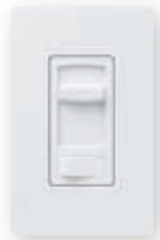
Skylark Contour™/C•L™* Gloss colors