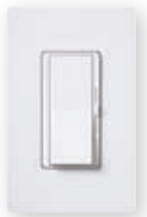
Diva®/C•L™ Gloss and Satin Colors®