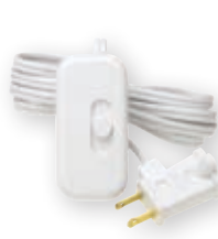
Credenza®/C•L™ Black (BL), White (WH), and Brown (BR)