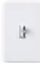
Ariadni®/C•L™ Gloss colors Coming Soon