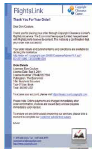
Customer receives Order Confirmation email.