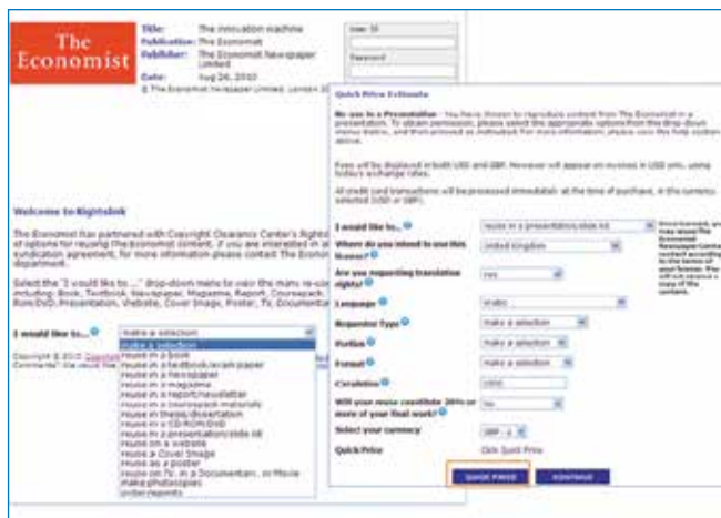
RightsLink launches, customer selects licensing option, answers publisher’s questions, agrees to the pricing and completes the order.

RightsLink turns content browsers into customers.