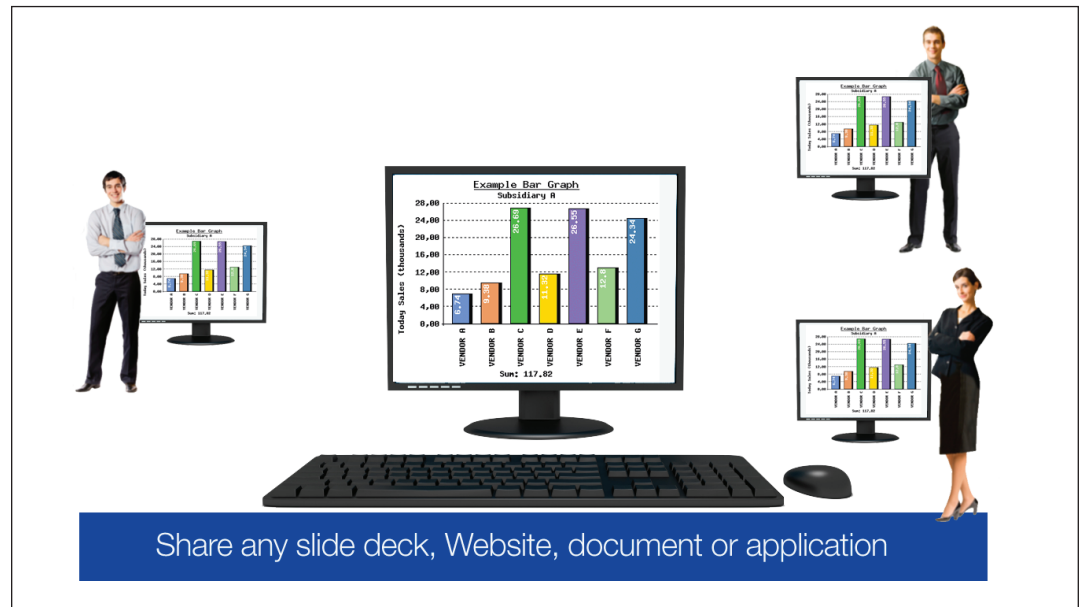
Figure 3: Screen Sharing Capabilities

Of course, collaboration wouldn't be complete without on-screen annotation tools. GoToMeeting Corporate enables you and your attendees to draw, highlight and point to items of interest on the screen. Also, you and your attendees can chat in real time privately (person to person) or publicly (broadcast to all attendees). Best of all, if attendees want to run with ideas before inspiration slips away, seamlessly transfer control of your keyboard and mouse or let attendees share their desktops by switching presenters.